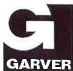
EXHIBIT A AMENDMENT NO. 1A SCOPE OF SERVICES